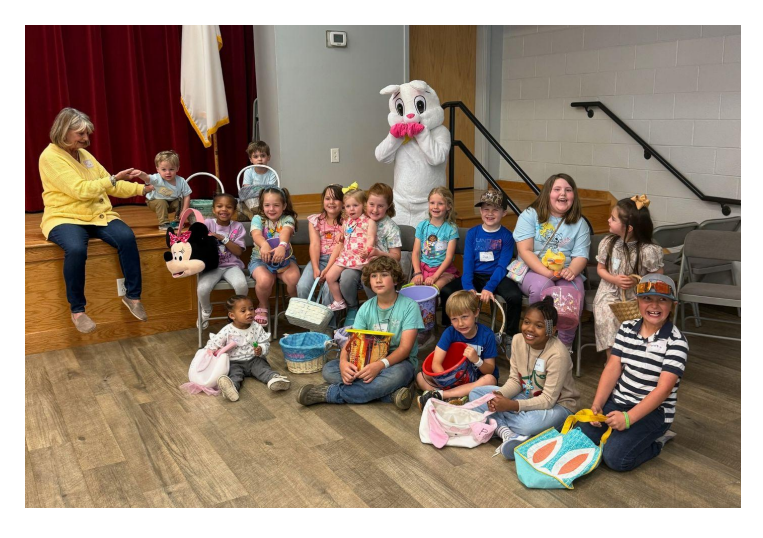
The Children and Youth had a WONDERFUL time at the Easter Egg hunt in April!